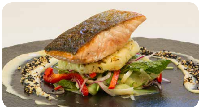
Catch of the Day