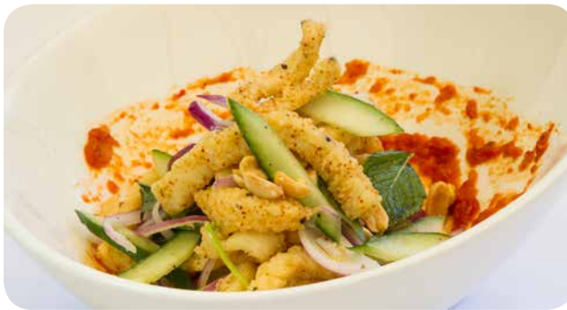
Spiced Crispy Calamari