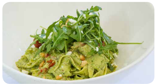
Rocket Pesto Pappardelle