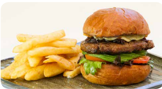
Wagyu Beef Burger

GREEN ISLAND RESORT GREAT BARRIER REEF - AUSTRALIA